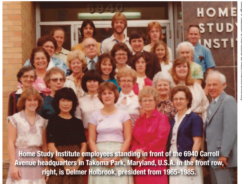
College of Education & International Services, Andrews University.

Today, correspondence schools and distance education continue to play a vital role in the educational development of students in many parts of the world